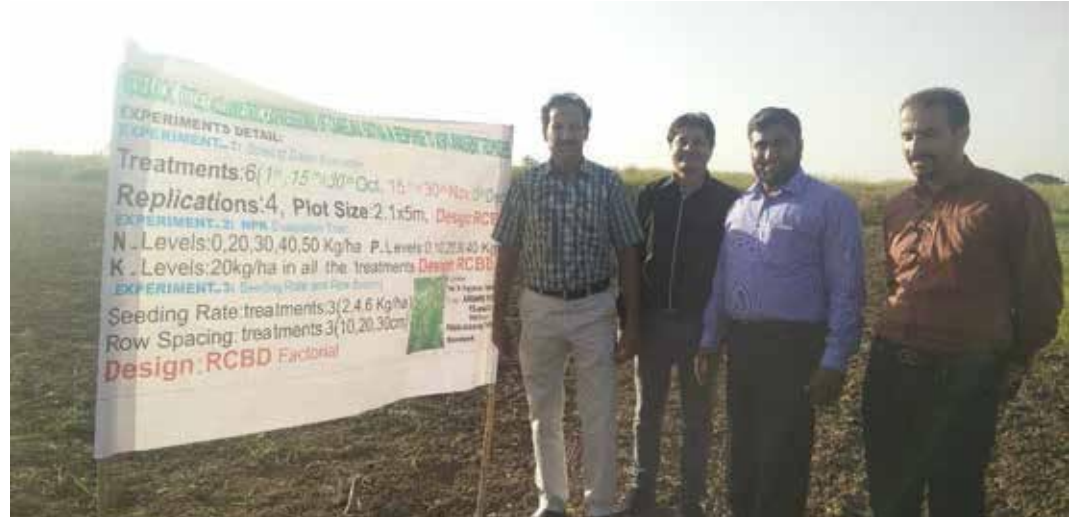
Visit of AICs to PMAS AAU, Rawalpindi

Weaknesses: (i) Insufficient lab equipment and absence of safety measures; (ii) Lack of proper lecture rooms with teaching aids; (iii) Inadequate internship programme at undergraduate level; (iv) Experimental Farm is far away for student training and research; (v) Absence of green/glass house for conducting controlled conditions experiments.