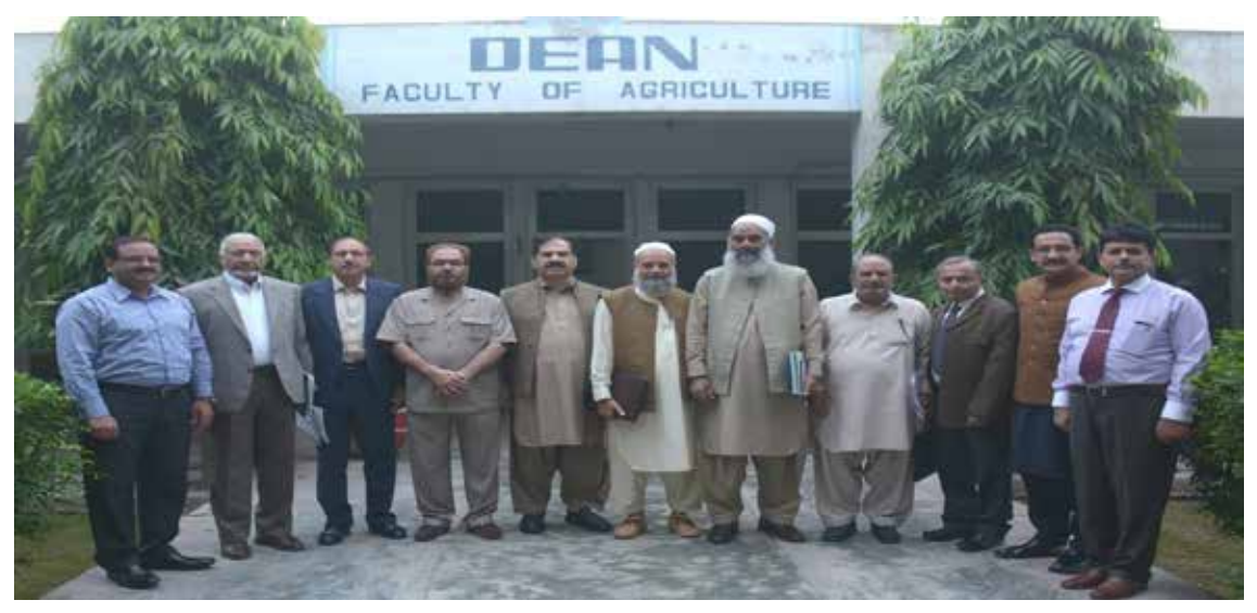
Visit of AICs to University of Agriculture, Faisalabad