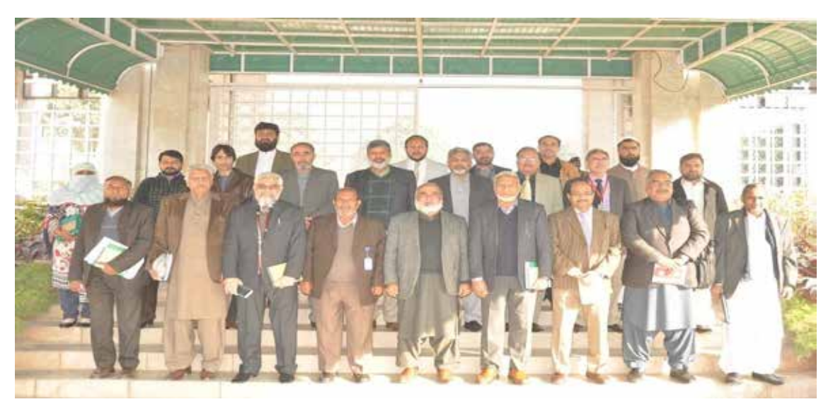
Visit of AICs to The University of Agriculture, Peshawar