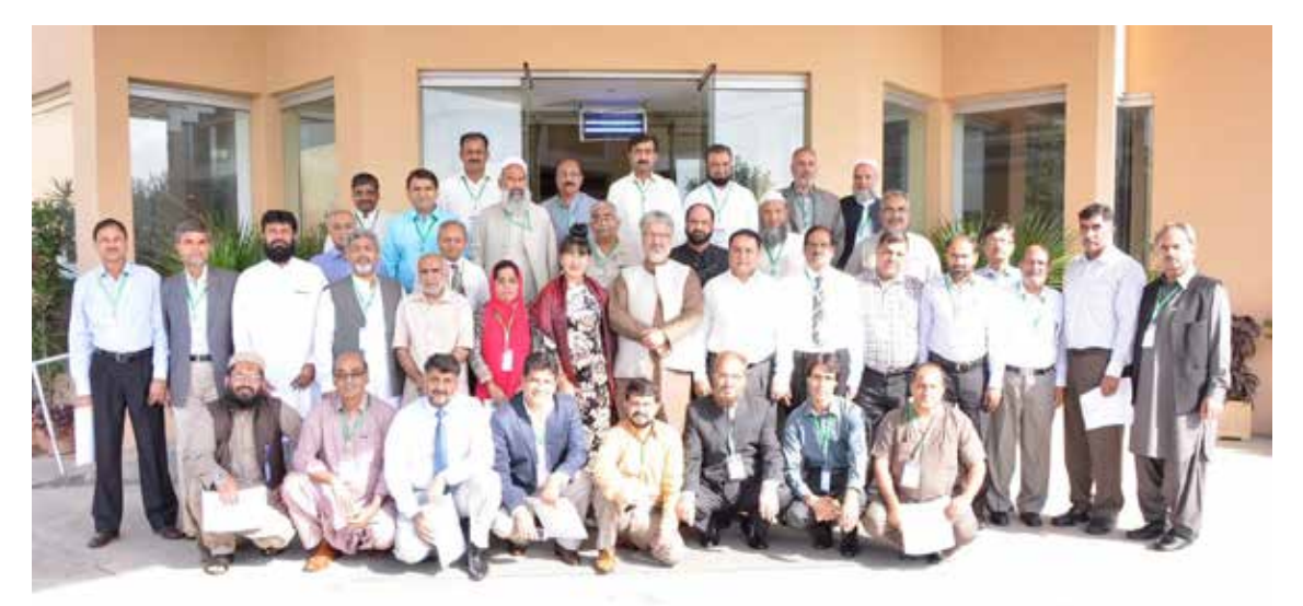
4<sup>th</sup> Training Workshop for Programme Evaluators of NAEAC