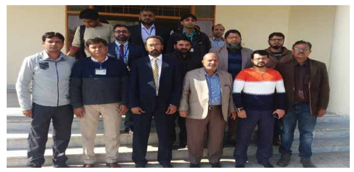
Awareness Seminar at UAF – Sub Campus Depalpur - Okara