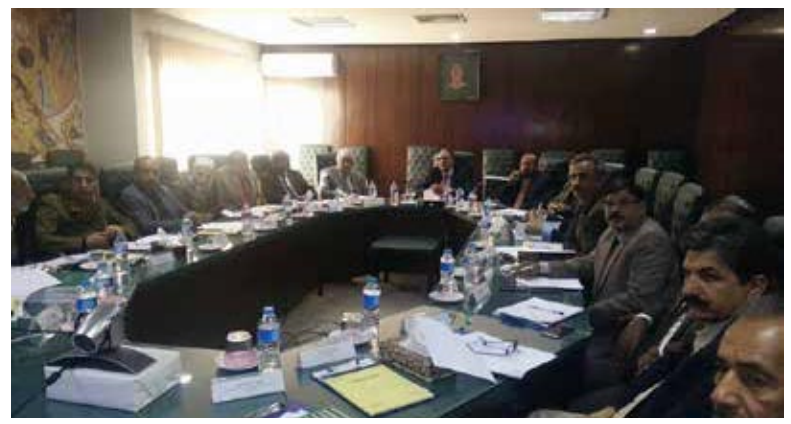
13<sup>th</sup> Council Meeting

Council Member of NAEAC since its inception for making significant contributions to the evolution of the Council to its current status. His continuing support and involvement in the activities of the Council were highly appreciated and commended.