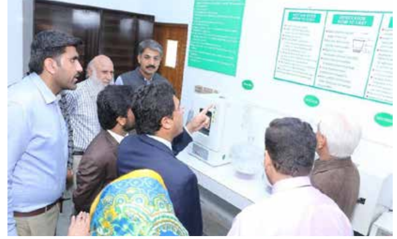
Visit of AIC to GCUF - Sahiwal Campus

of independent QEC with proper staff reporting directly to the Vice Chancellor; (vi) Non-availability of Director Academics for effective academic control and ensuring quality education; (vii) Lack of academia–industry linkages through functional MOUs; (viii) Limited opportunities for students and the faculty for study tours and participation in conferences; (ix) Lack of operational funds with HoD for purchase of chemicals and glassware; (x) Internship programme of 8<sup>th</sup> semester students is ineffective and least useful.