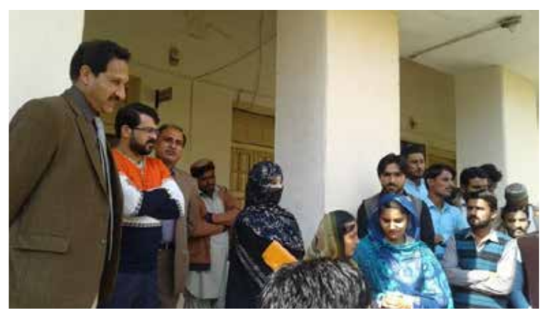
Visit of AICs to SAU, Tandojam

(i) Obsolete lab equipment for both teaching and research; (ii) Least international exposure of faculty;