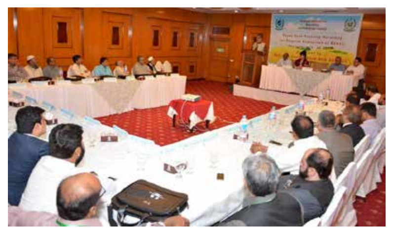
4<sup>th</sup> Training Workshop for P.Es of NAEAC

Chairman, NAEAC is empowered to constitute an accreditation inspection committee (AIC) comprising of two program evaluators/ experts and the Secretary NAEAC as Member Secretary of AIC for the onsite visit to the degree programs of agri. education