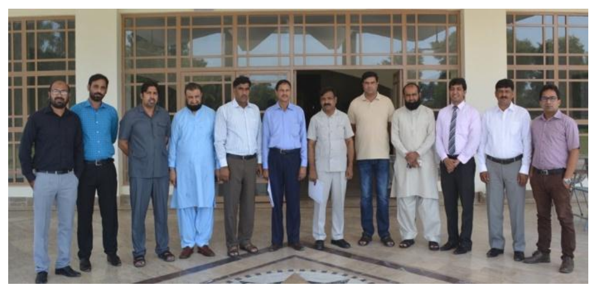
Visit of AICs to UCA&ES, The Islamia University of Bahawalpur