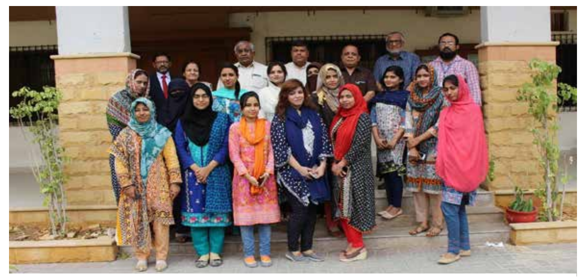
Visit of AICs to Jinnah University for Women, Karachi