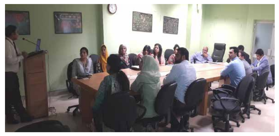
Visit of AIC to The University of Lahore