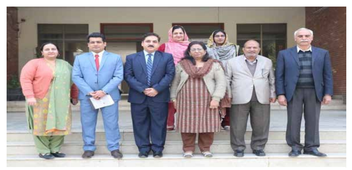
Visit of AIC to Govt. College Women University, Faisalabad