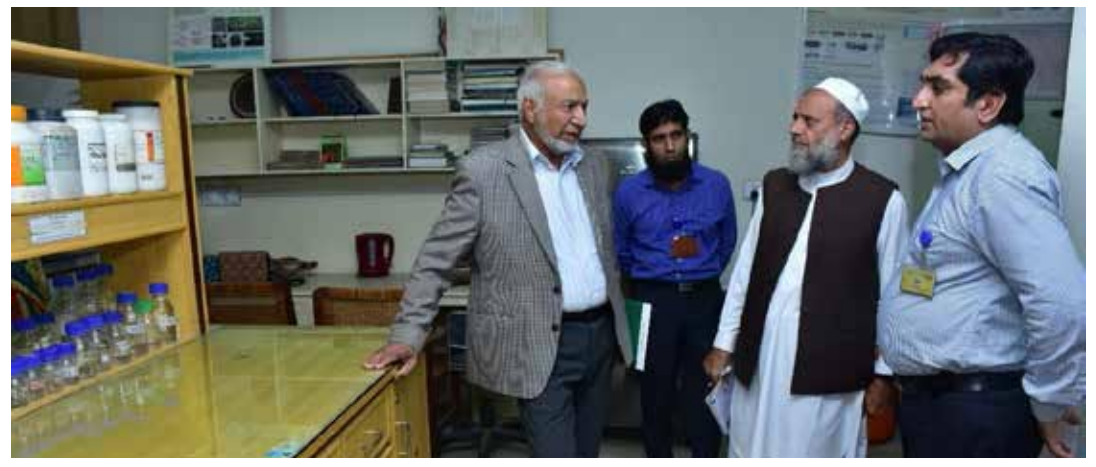
Visit of AICs to UAF

graduate research funds are inadequate; (iv) Merit scholarships are very few; (v) Only one full time full Professor in the Center; (vi) Centralized administrative and financial system; (vii) Non-availability of trained laboratory staff; (viii) Limited computing and internet facilities for the students.