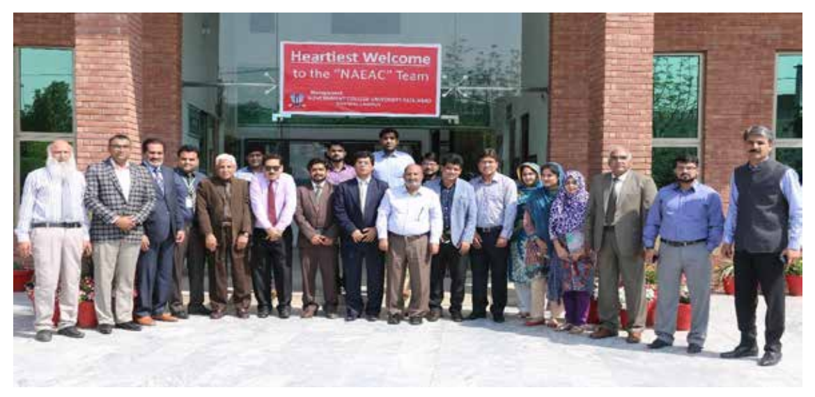
Visit of AIC to Govt. College University Faisalabad – Sahiwal Campus