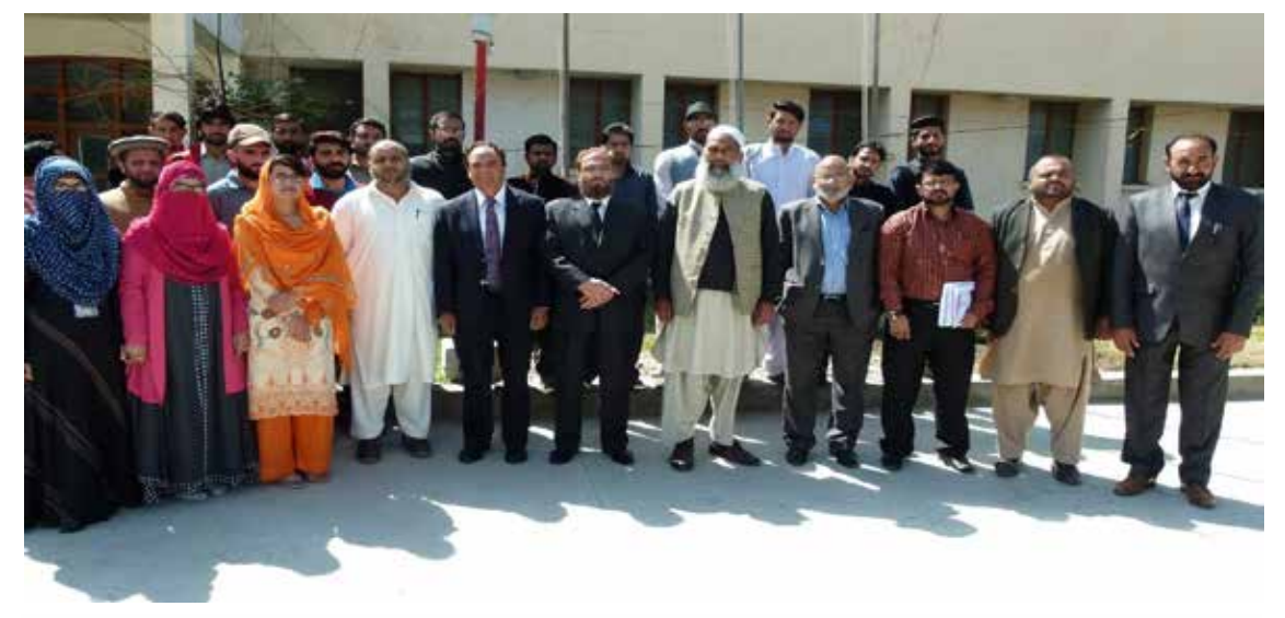
Visit of AIC to The University of Poonch, Rawalakot