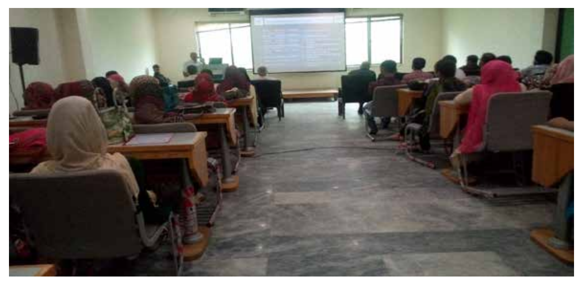
Awareness Seminar at Minhaj University, Lahore