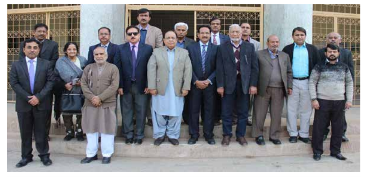
Visit of AICs to Sindh Agriculture University, Tandojam