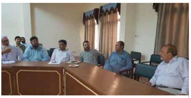
Review Meeting at Gomal University, D.I. Khan

10 Formal accreditation visit and subsequent follow-up visit to the degree programmes of these disciplines were carried-out during 2013 and respectively. 2016. Degree programmes of Entomology and Agronomy discipline were consistently rated sub-standard