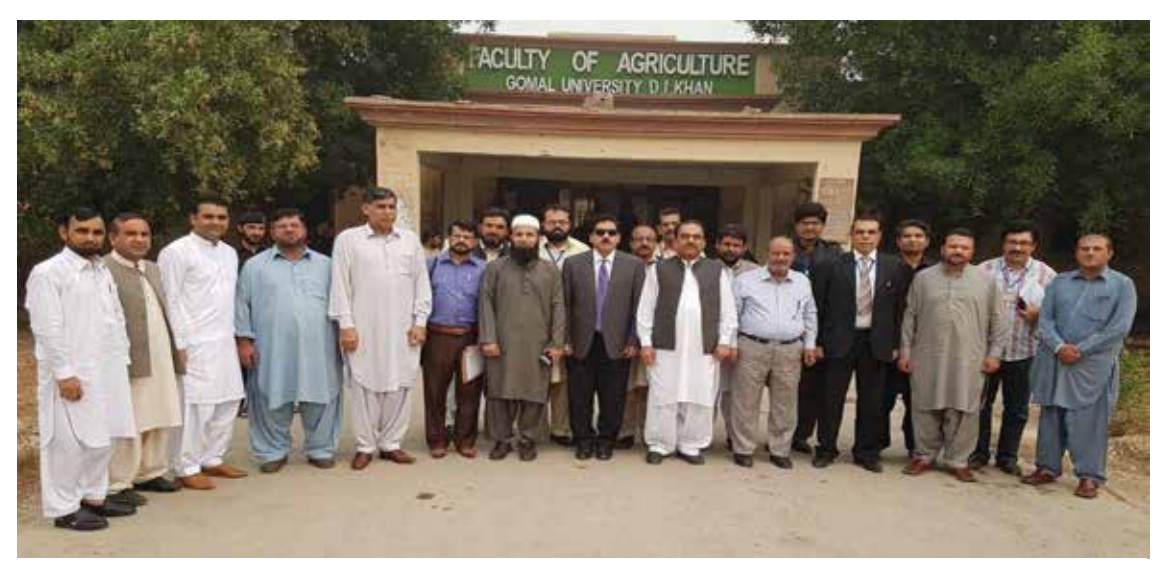
Visit of AICs to Gomal University, D.I. Khan