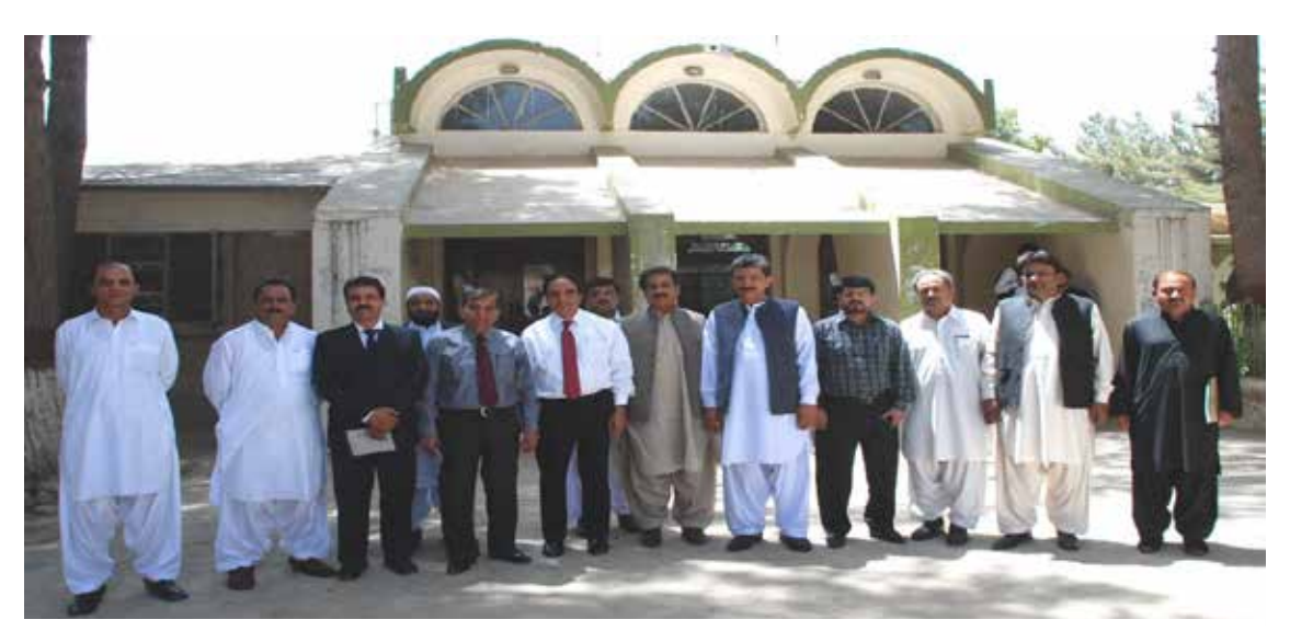
Visit of AICs to Balochistan Agriculture College, Quetta