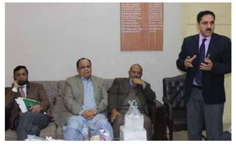
Visit of AICs to SAU, Tandojam

Strengths: (i) Wellequipped and functional labs; (ii) Big food hall processing for practical training of the students; (iii) Students have а sense of satisfaction as far as teaching methodology of the teachers was concerned.