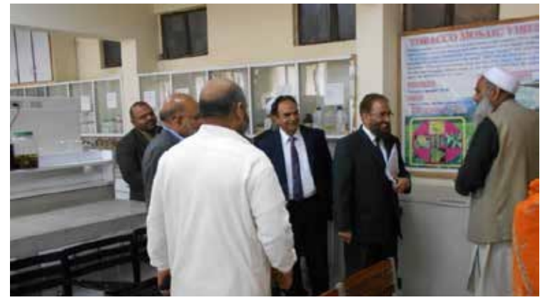
Visit of AIC to The University of Poonch, Rawalakot

respectively, (ii) Out of six faculty members, three have Ph. D and other three possess M.Sc. (Hons) degrees in relevant subjects. Four of them are permanent while one each has IPFP and visiting faculty status;