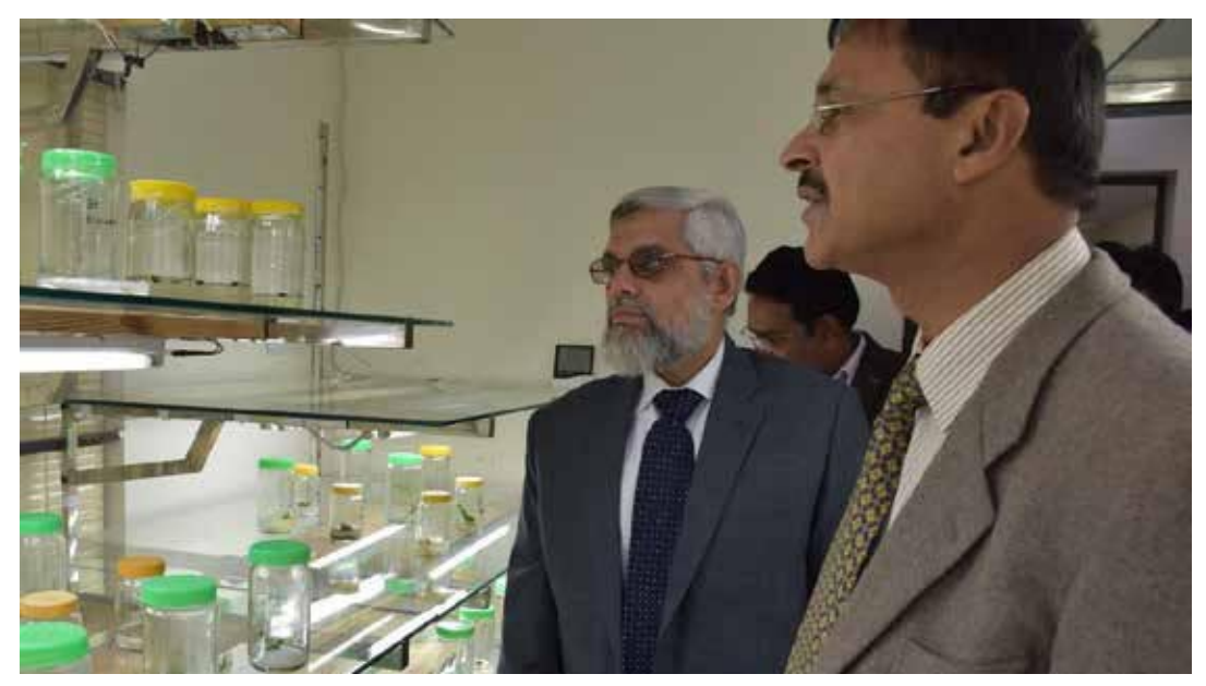
Visit of AICs to MNSUA, Multan

Weaknesses: (i) Inexperienced faculty with no experience of supervising graduate research; (ii) Out of total seven faculty members, five are with specialization in Pomology / Postharvest Technology of Fruits; (iii) Curriculum followed for undergraduate programme is not as per HEC guidelines; (iv) Limited research facilities due to budget constraints; (v) Inadequate facilities of greenhouse, growth chambers, cold store; (vi) Non-availability of trained laboratory staff to operate and maintain the equipment and instruments; (vii) Faculty offices and lecture rooms are not spacious; (viii) No local or foreign journal has been subscribed; (ix) Limited computing and internet facilities especially for undergraduate students; (x) Students dissatisfied with hostel, sports and medical facilities.