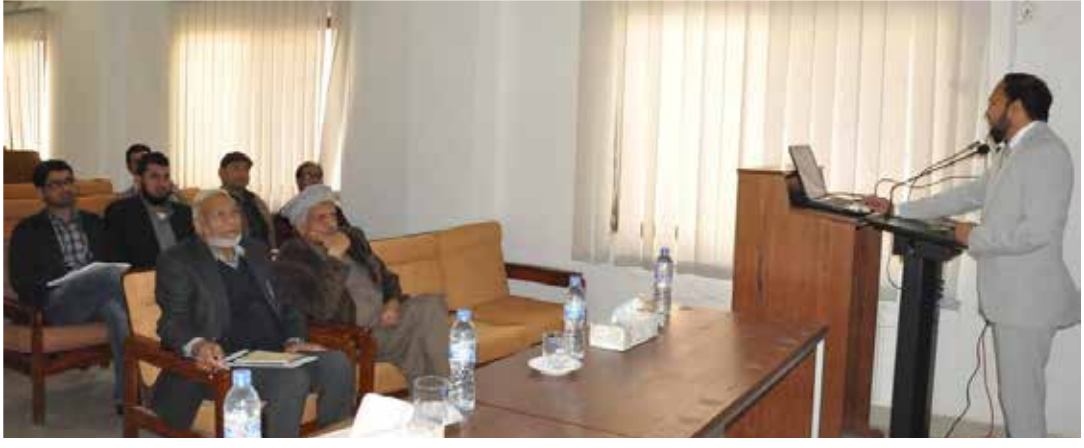
Visit of AICs to The UAP

Weaknesses: (i) Students complaints for the non-availability of merit scholarship; (ii) Annual allocation of budget is inadequate for the post-graduate research; (iii) Though first aid boxes are available in the labs but fire extinguishers are not in place; (iv) Medical as well as sports facilities are insufficient; (v) Although computer facilities are adequate but are having problems of continuous connectivity and download speed.