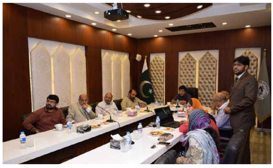
Visit of AIC to Minhaj University, Lahore

classrooms are insufficient; (vi) Lack of academia–Industry linkages; (vii) Inappropriate composition of Board of Studies.