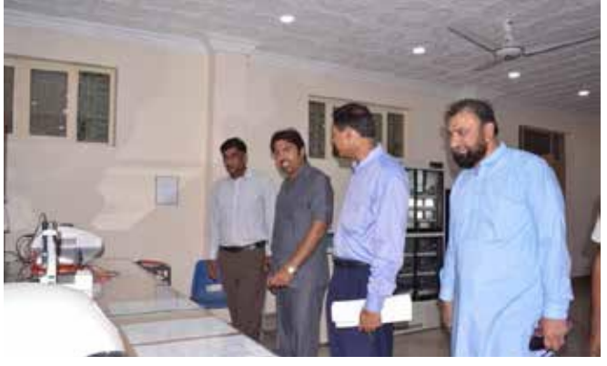
Visit of AIC to UCA&ES, IUB

recommended/reference Plant Pathology books in the main library; (v) Access to modern IT laboratory under the supervision of IT expert; batch of (vi) First B.Sc. (Hons.) Agriculture (Plant Pathology) 20 students has passed out in the early 2017; (vii) The cultivated area in the