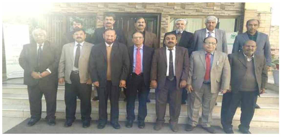
13<sup>th</sup> Council Meeting