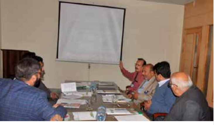
Visit of AICs to UOS-Lyallpur Campus, Faisalabad

deputed as member of Board of Studies of Institute of Food Science and Nutrition at main campus of University of Sargodha to ensure harmonization: proper (iii) Directorate of Academics and Quality Enhancement Cell (OEC) be need to