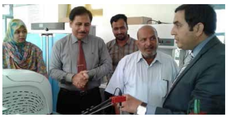
Visit of AIC to AAUR - Attock Campus

on contract. Most of the courses are being taught by visiting faculty from local Agriculture Extension Department; (ii) Hardly facility any for practical training of the students both in field and laboratory;