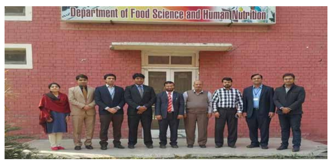
Visit of AIC to UVAS, Lahore